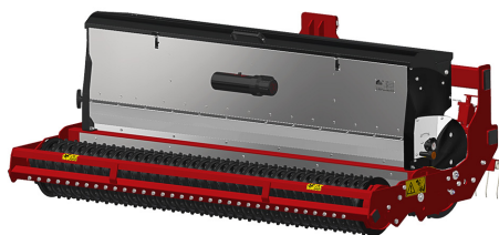
Stainless steel gravity seeder