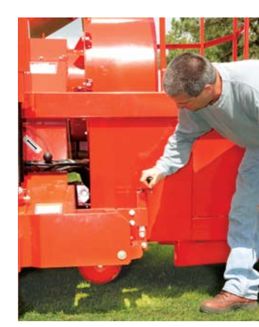
THE FRONT ROLLER HEIGHT ADJUSTMENT IS EASILY DONE WITHOUT THE NEED OF TOOLS.

The standard vacuum head of the Multi-Vac may be replaced with a Verti-Tatch head to dethatch & pick-up debris all in one pass. (spacing 1 ½ inch cc.)